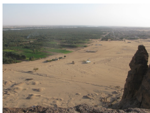
View from Gebel Barkal