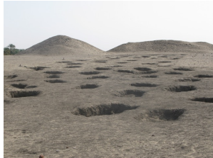
At Eastern Deffufa (Kerma)

Dinner and overnight at a private house in Karima