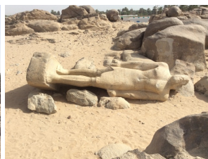
Statue in Tombos