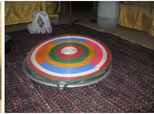
Sudanese food serving