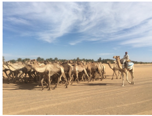
Camel caravan at Toshka