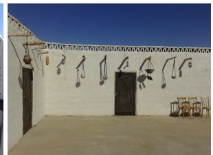
Inside Magzoub Hostel

*It is recommended to start the program on Fridays (end on Fridays accordingly).