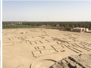
At Western Deffufa (Kerma)