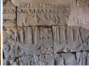
Inside a pyramid chapel