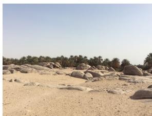
Tombos Archeological Site