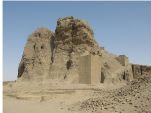
Western Deffufa (Kerma)