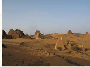
Pyramids of Meroe