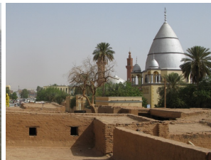
Khalifa's House & Mahdi's Tomb