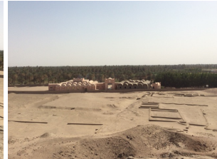
Museum in Kerma