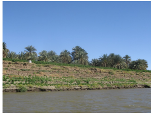
Agriculture at the Nile