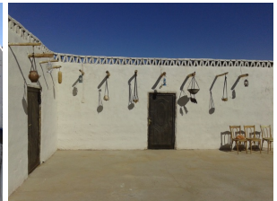
Inside Magzoub Hostel

*It is recommended to start the program on Fridays (end on Mondays accordingly).