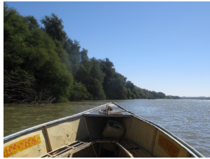
Boat ride on the Nile

Day 4 Abri - Amara West Archeological Site – Sai Island Archeological Site – Abri Visit of the Archeological Sites of Amara West and Sai Island by boat (full day) Lunch picnic Dinner and overnight at Magzoub Hostel