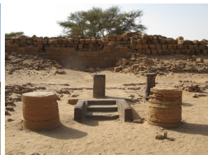
Royal City of Meroe