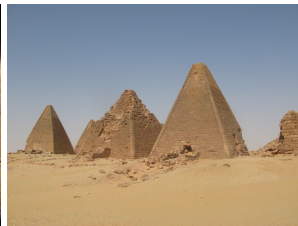
Pyramids at Gebel Barkal