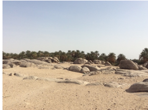
Tombos Archeological Site