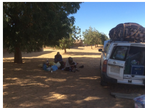
Lunch picnic at Toshka