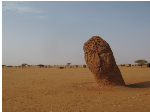
Termite Hill north of Khartoum

Full day drive to Abri Lunch picnic Dinner and overnight at Magzoub Hostel