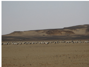
Storks in the desert