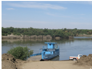
Ferry over the Nile

Day 5 Abri – Toshka Village – Desert Crossing of the Nile by ferry, drive to Toshka Village Lunch picnic at Toshka Desert tour Dinner and overnight in desert camp