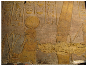
Inside Mut Temple