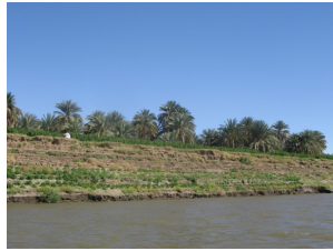
Agriculture at the Nile