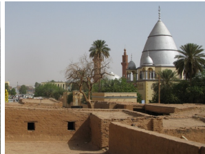
Khalifa's House & Mahdi's Tomb