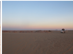
Sunset in the desert

Day 6 Toshka – Sedenga Temple – Gebel Dosha Archeological Site - Soleb Temple – Sesibi Temple – 3rd Cataract – Sebu Petroglyphs Visit of Sedenga, Soleb, Sesibi Temples and Gebel Dosha Archeological Site on the West Side, crossing of the Nile by ferry in Delgo, visit of 3rd Cataract Lunch picnic at 3rd Cataract Visit of Sebu Petroglyphs Dinner and overnight in desert camp in Sebu