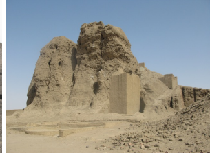
Western Deffufa (Kerma)