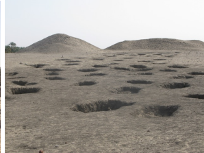
At Eastern Deffufa (Kerma)