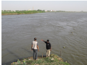
Confluence of the Nile