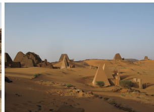
Pyramids of Meroe